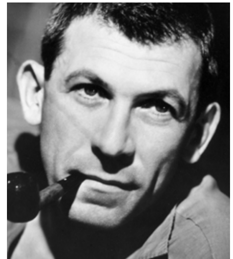
Richard Brooks, who wrote the novel The Brick Foxhole while still an active Marine, went on to have a successful career as a screenwriter, director, and producer