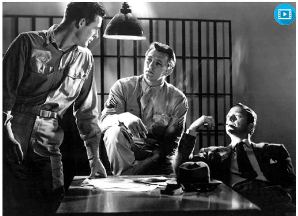
Montgomery (Robert Ryan) puts up a reasonable front while Sgt. Peter Keeley (Robert Mitchum) and Capt. Finlay (Robert Young) attempt to piece together events leading to Crossfire's central murder