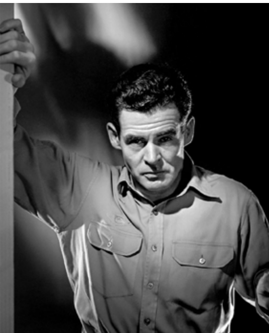
Robert Ryan projects malevolence in his impressive performance as Montgomery