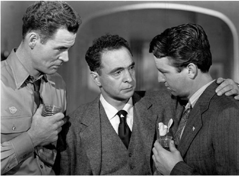
Joseph Samuels (Sam Levene, center) attempts to connect with Floyd Bowers (Steve Brody, right) as Montgomery (Robert Ryan) watches intently